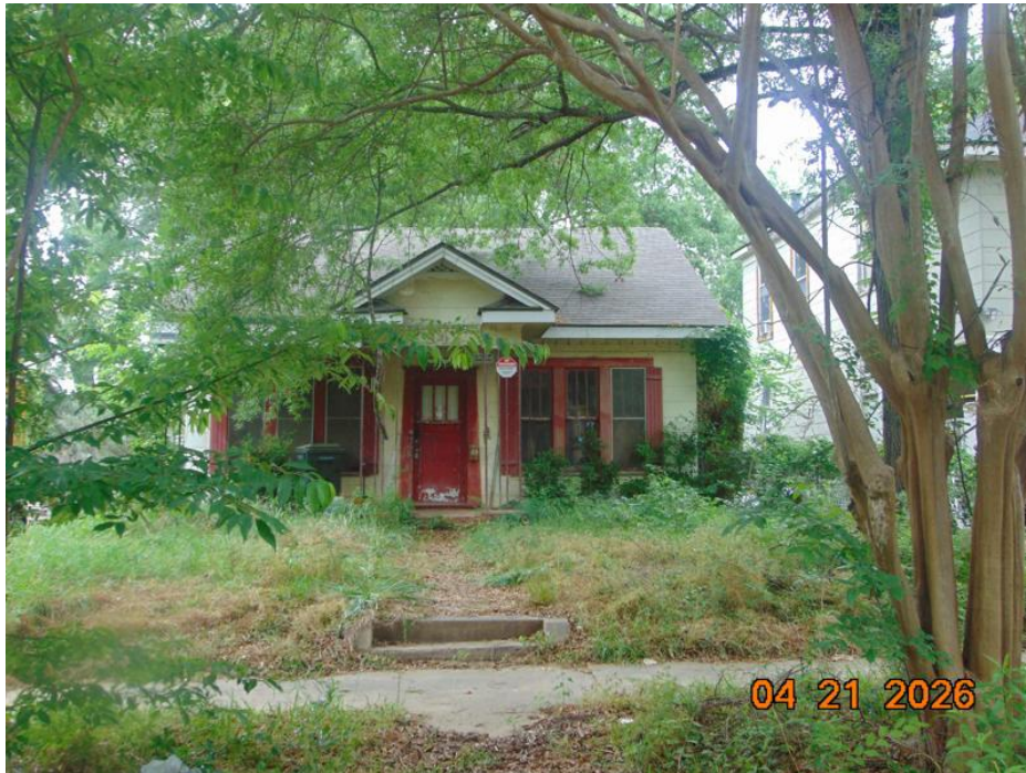
Exhibit B. - Zoning Map