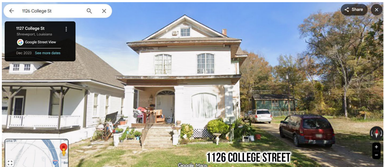
Exhibit A. - Front Façade