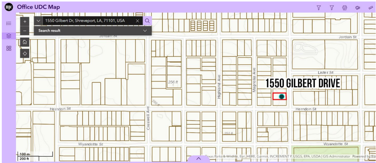
Exhibit C. - Vicinity Map