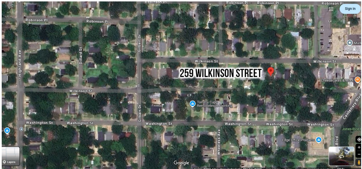
Exhibit D. Project Scope