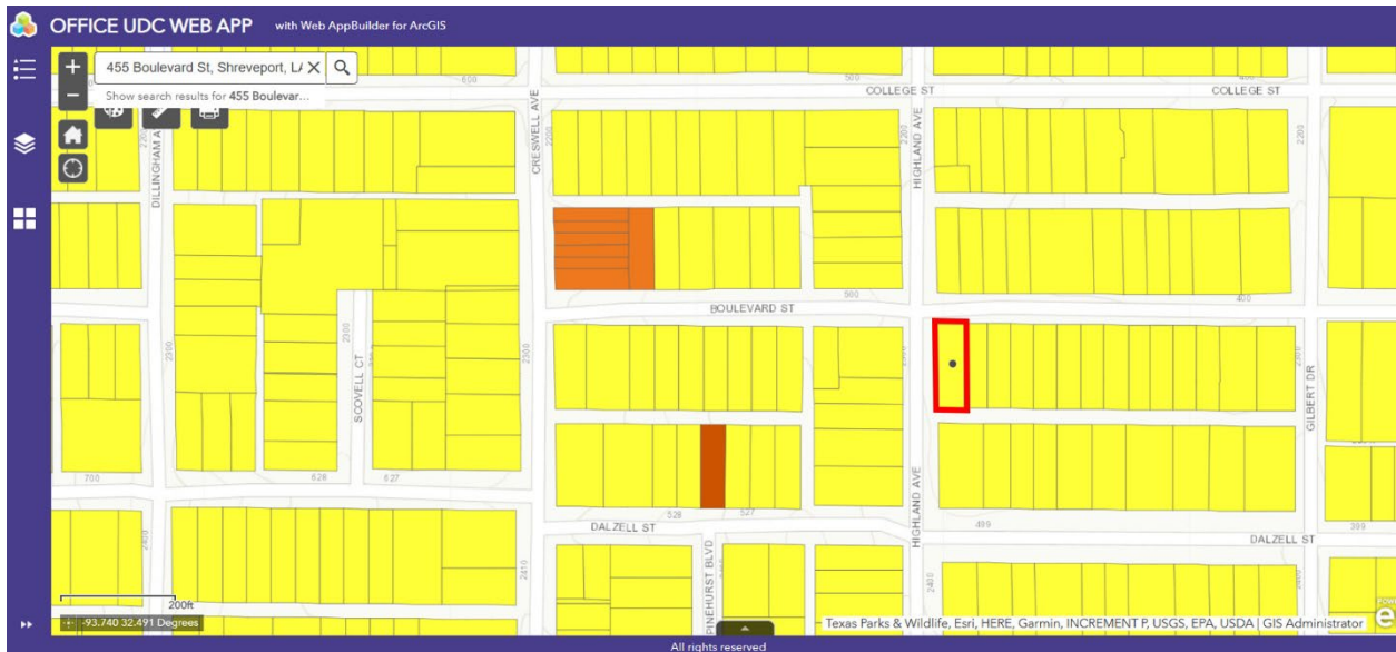
Exhibit C. - Vicinity Map