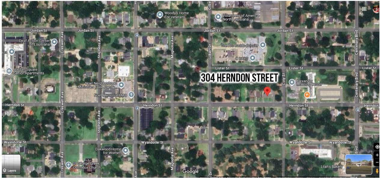
Exhibit D. Project Scope