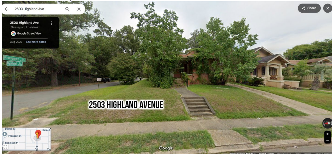
Exhibit A. – Home Façade