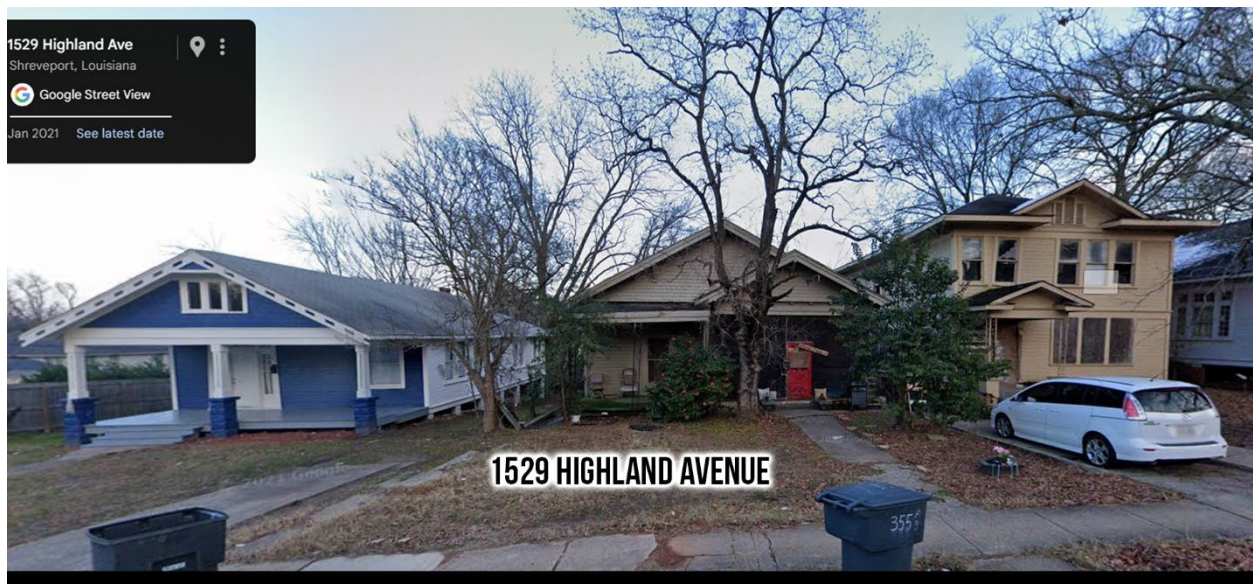
Exhibit A. - Home Façade