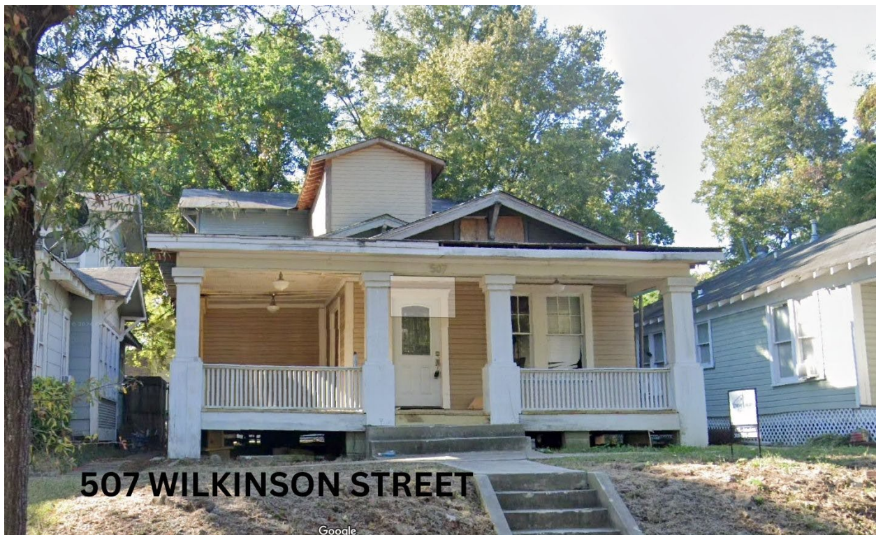
Exhibit A. Front Facade View