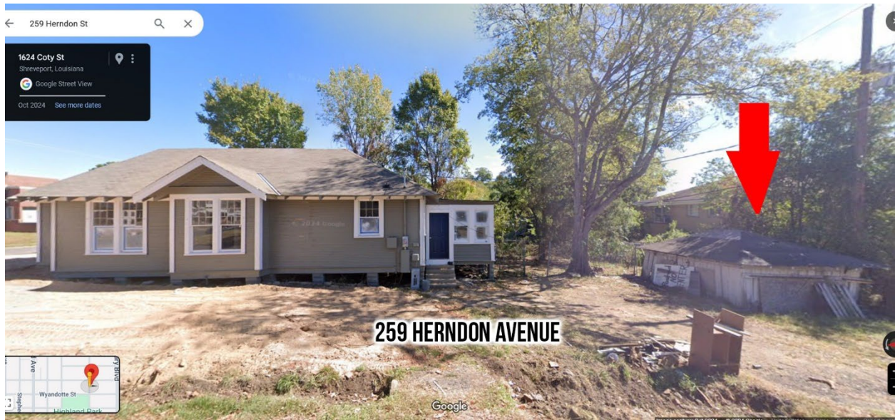
Exhibit E. Shed images