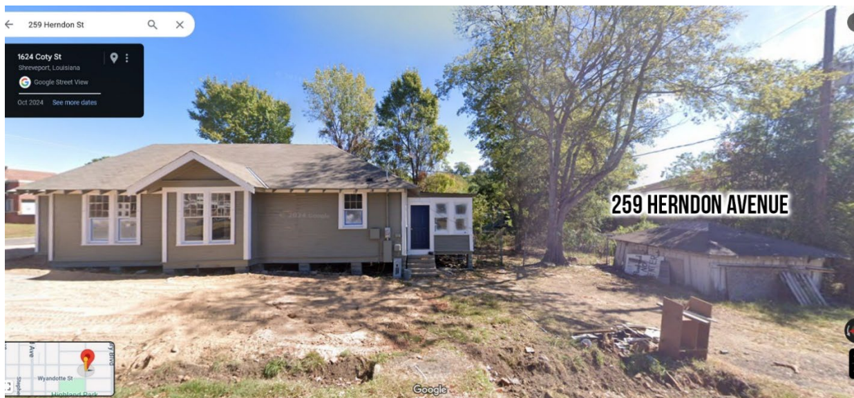
Exhibit A. Front Facade View