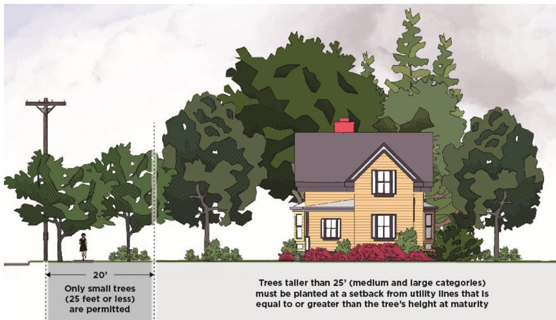
FIGURE 10-1: OVERHEAD UTILITY PLANTING ZONES