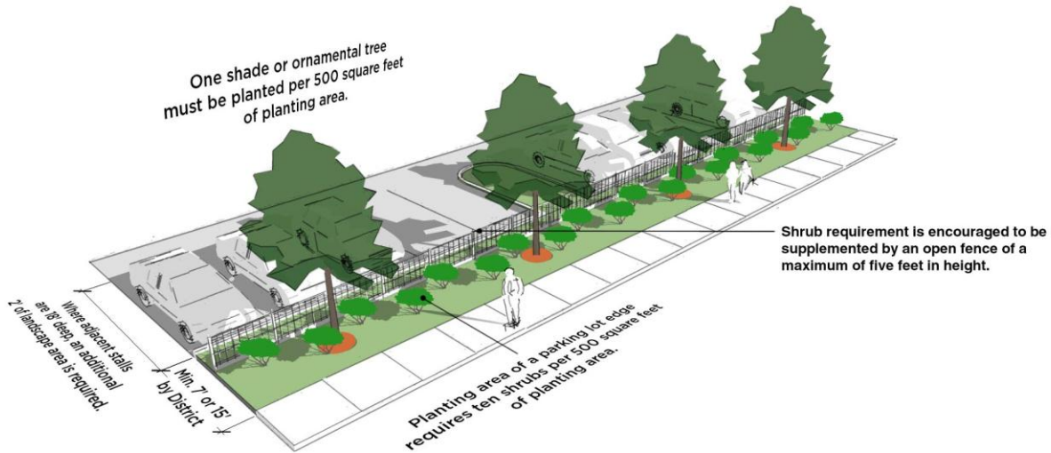
FIGURE 10-3: PARKING LOT PERIMETER LANDSCAPE