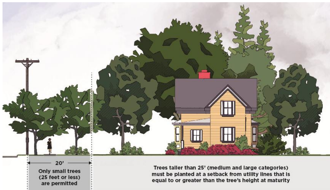
FIGURE 10-1: OVERHEAD UTILITY PLANTING ZONES